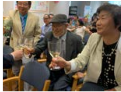
Toast for Korean Seniors