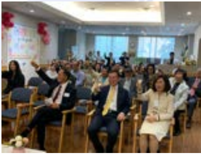
Toast for the 2nd LTC