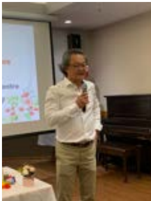
Congratulatory Message Tong Hahn