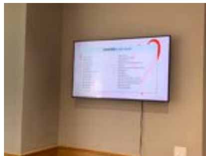
Donors Screen at Lobby