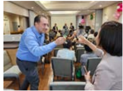
Toast for AKLTC