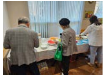
Refreshment & Social