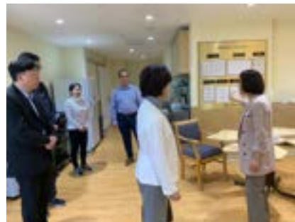
Tour of the Residence Floor