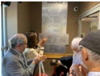
Unveiling of Donors Wall